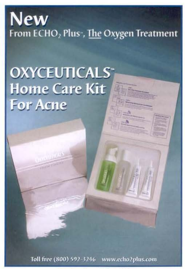
Reader Service No. 213

Why is it that women seem to lose their eyebrows as they get older?