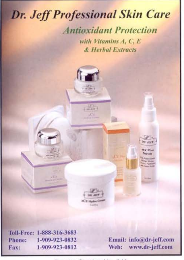
Reader Service No. 248