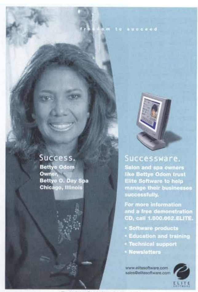
Reader Service No. 169